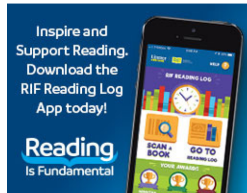
250 x 200 px banner example