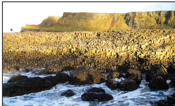
The Giant's Causeway

The Red Giant began to tremble in fear. He fled from Finn MacCool's house and ran back to Scotland over the causeway. He destroyed much of the causeway on his way back, for he was scared that Finn would try to follow him. The Red Giant was never seen in Ireland again. But what's left of the causeway remains until this day.