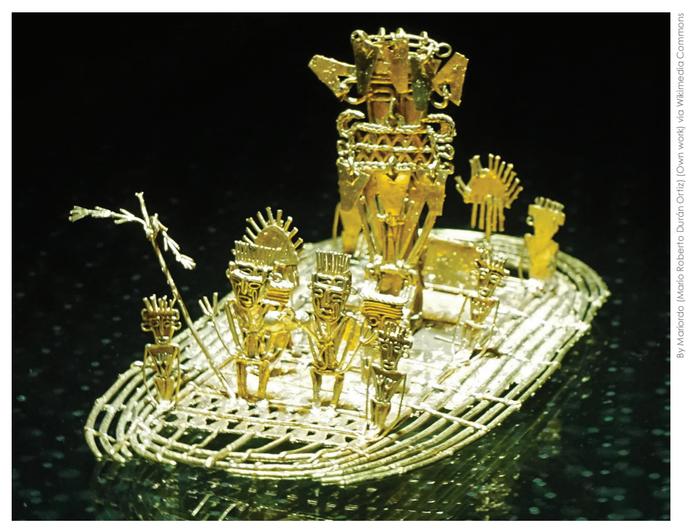
A golden Muisca raft

The Muisca people of Colombia had an unusual line of succession for its zipas, or rulers. The zipa's oldest sister's oldest son always became the next zipa. Tisquesusa became zipa of the southern Muisca Confederation in 1514 after his uncle died. The Muisca Confederation was one nation of people that was ruled by different people in the north and south.