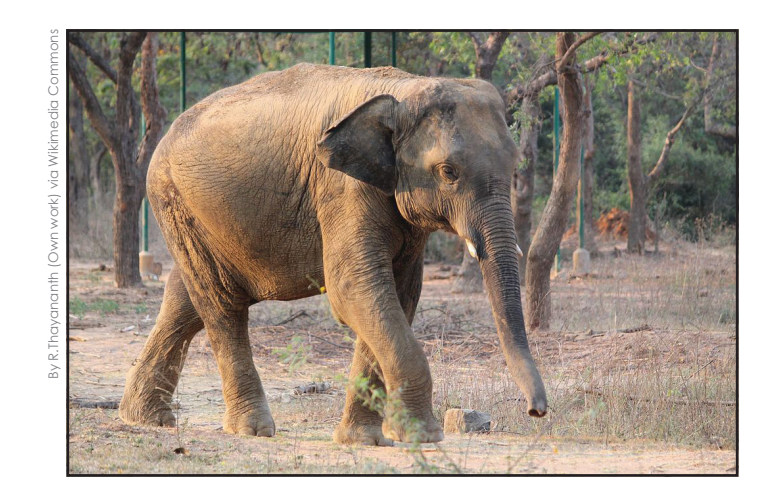
What is it? It is an elephant.