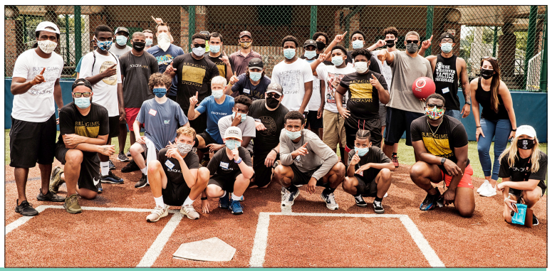
Son of a Saint mentees, mentors, and staffers play kickball in 2020.

5. Gain exposure. Find your passion. Exploration of different things is the only way you'll encounter things you can be passionate about. This tip is worth repeating: Don't limit yourself!