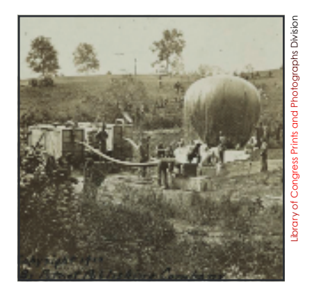
Filling a hot air balloon on the battlefield

Each hot air balloon was tethered to the ground by a long rope to keep the balloon from flying away in the wrong direction. A pilot took the balloon up 500 feet. He looked around and wrote down what the Southern troops were doing. When he was done, the pilot took the balloon back down and reported to the army leaders what he saw. Now the army leaders knew what to expect from the Southern army. They knew how far away the enemy was. They knew how many men the enemy had. They could use this information to make better plans for how to fight the enemy. This helped the North win the war.