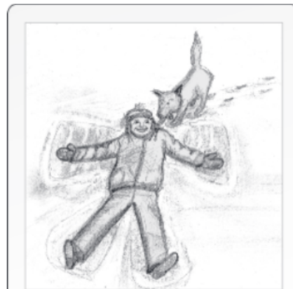
Bindi and me in the snow.