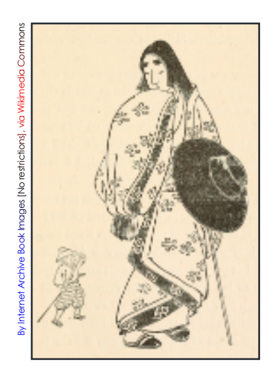
One-Sun Boy and the Princess take a walk together

One-Sun Boy found a job in the city. He worked for a rich lord. The rich man had a pretty daughter. She was a princess. One-Sun Boy became friends with her.