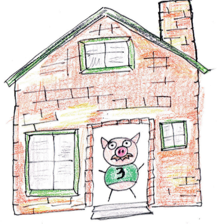
Pig Three was the oldest. He built his house out of bricks. His house was very strong.

Pig Two was the middle pig. He built his house of sticks. It was a bit stronger than Pig One's house. But not that much stronger.