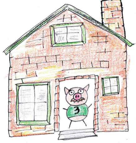
Pig Three was the oldest. He built his house out of bricks. His house was very strong.