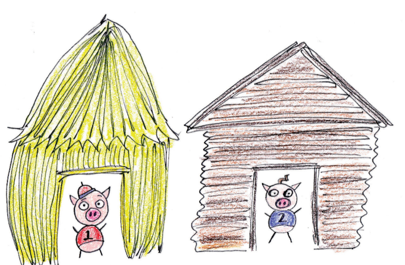
Pig One was the youngest. He built his house from straw. It was not a strong house. But it was a house.