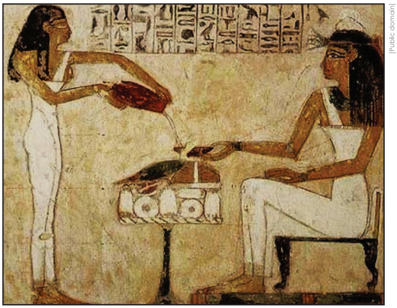
Egyptian hieroglyphics appear at the top of the picture

Egyptian writing is called hieroglyphics. Hieroglyphics use simple pictures called glyphs. The glyphs stand for different words. To read hieroglyphics, you must know the meaning of each glyph. The writing you are reading right now uses letters to form words. The letters come from an alphabet. Each letter makes a sound. You can put different letters together to form words. The letters form the sounds of the words we speak. The Greeks used an alphabet to write, too.