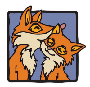
nuzzle: to lie very close to; to touch gently with your face; to cuddle

perched: seated or placed on top of something; in a high place