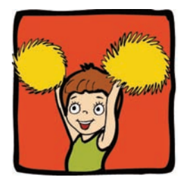
inspire: to make someone want to do something