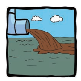
suffer: to hurt or be unhappy