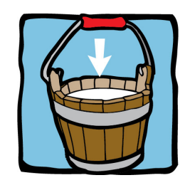
brim: the top edge of a glass or container

coop: a cage or small building where chickens are kept