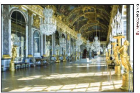
Inside Versailles: the Hall of Mirrors