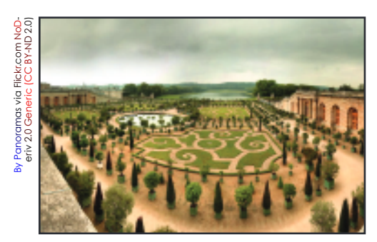
A garden at Versailles

Versailles is likely the best-known castle in all of France. It is located near Paris. It was not built as a fortress. It was built as a palace. It was meant to be a place where the king could live. Versailles is luxurious and beautiful both inside and out. King Louis XIV made this palace the center of his kingdom in 1682. King Louis XIV loved beauty. He wanted only the finest clothing, art, music, and gardens in his palace. The palace has 2,300 rooms and spreads over nearly 40 square miles of land. This includes its many gardens, fountains, and various buildings. Today the castle is a museum. About five million people visit the palace every year. Between eight to ten million walk through the castle's gardens each year. This makes it the most visited castle in all of France.