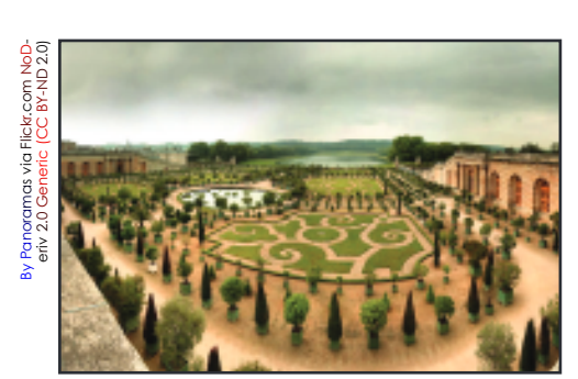
A garden at Versailles

Versailles is one of the best-known castles in France. It is located near Paris. It was not built to keep out invaders. It was built as a palace. It was meant to be a place where the king could live. Versailles is luxurious. It is beautiful both inside and out. King Louis XIV made this palace the center of his kingdom in 1682. The palace has 2,300 rooms. It spreads over nearly 40 square miles of land. This includes its many gardens, fountains, and various buildings. Today the castle is a museum. About five million people visit the castle every year. Between eight to ten million people visit the castle's gardens each year. This makes it the most visited castle in all of France.