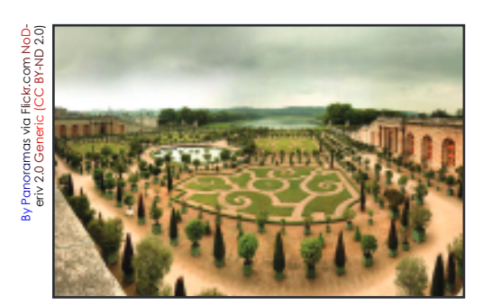
A garden at Versailles

This is one of the best-known castles in France. It is near Paris. It was built as a palace. It was a home for the king. This castle is beautiful both inside and out. It spreads over nearly 40 square miles of land. The palace has 2,300 rooms. It has many gardens and fountains. Today it is a museum. About five million people visit it every year. Nearly ten million people visit its gardens each year. It is probably the most visited castle in all of France.