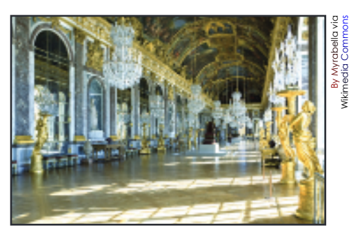
Inside Versailles: the Hall of Mirrors