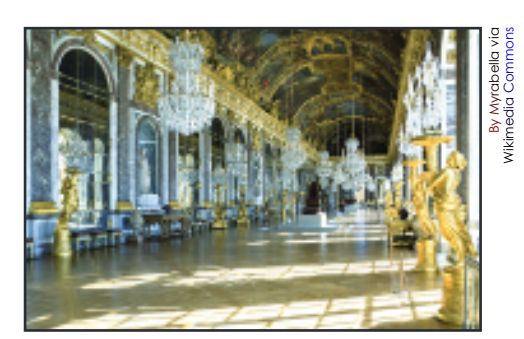
Inside Versailles: the Hall of Mirrors